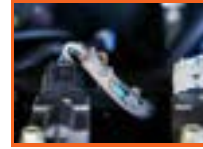
Above: Rodent Nest and Chewed Wires Inside Car Engine